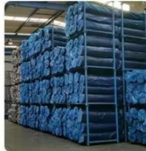
fabric roll storage