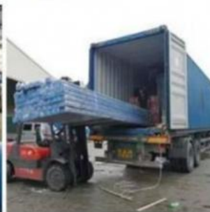
Loading for Wire Mesh Cage