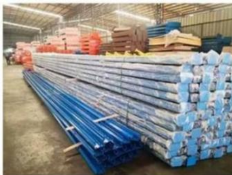
Package for Upright Frame