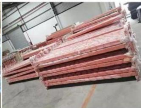
Package for Beam