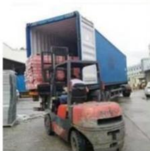
Loading for Beam